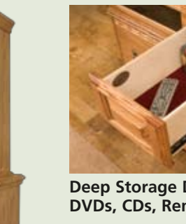
Deep Storage Drawer for DVDs, CDs, Remotes, etc.