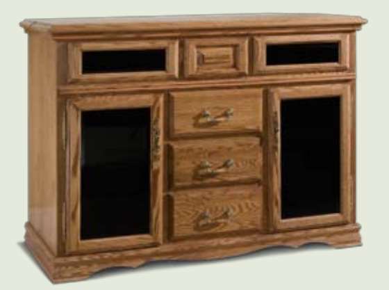
Create your own look. Optional glass panels for the cabinet doors (specify when ordering).