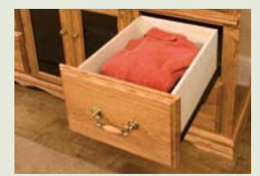
Four Full Extension Drawers for Storage.