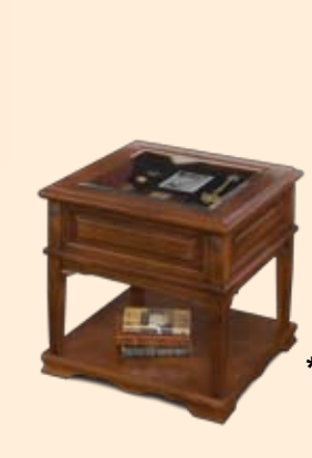
TABLE FEATURES & BENEFITS