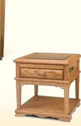
TABLE FEATURES & BENEFITS